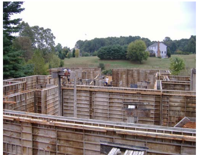
(Concrete is poured for the foundation wall)

Financing the construction project is a very critical issue. When I talked to a few lenders to give me the construction loan, they denied financing as I didn't have any building experience. They only finance if a licensed builder builds the house. So I had no other choice except taking home equity loan of my old house. I knew the equity amount will not be sufficient enough